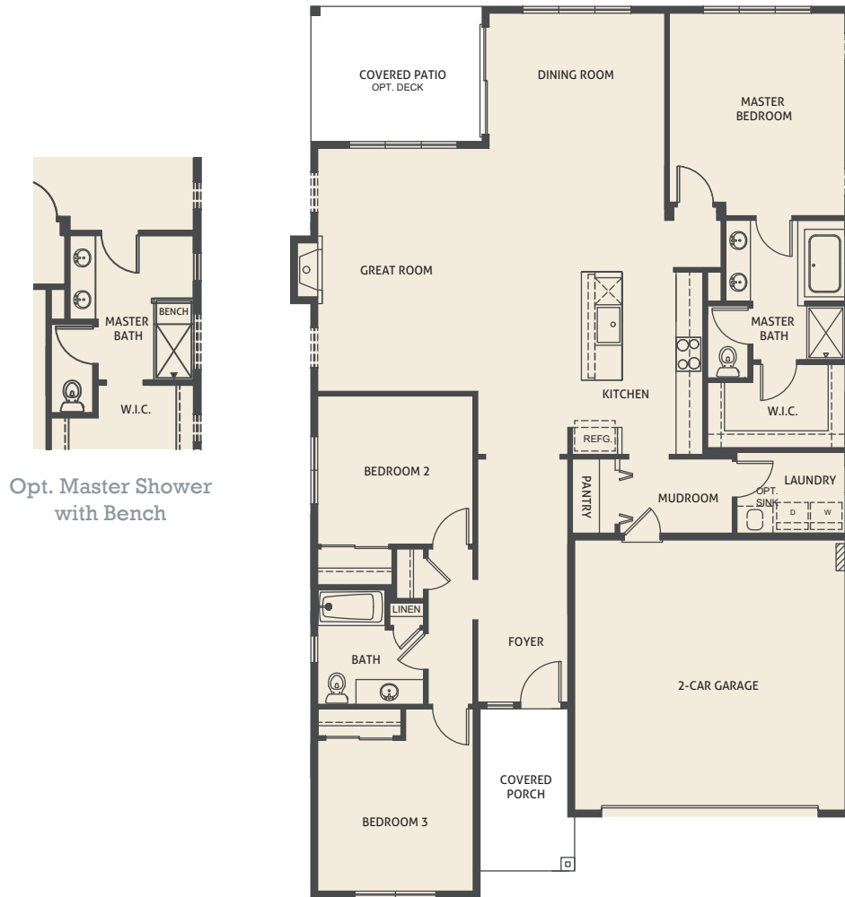
Opt. Master Shower with Bench